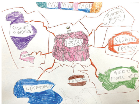
1 Mind Mapping connects thoughts, Bellevue Heights PS, Year 3, 2023