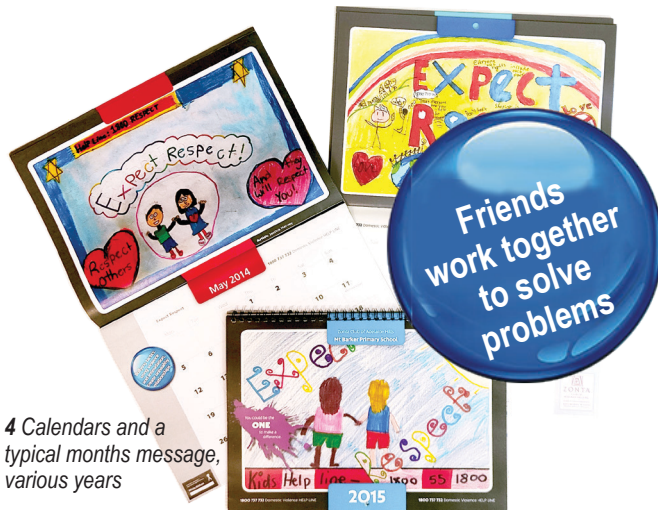
4 Calendars and a typical months message, various years

There are five steps to doing the Expect Respect Project