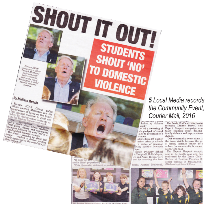
5 Local Media records the Community Event, Courier Mail, 2016