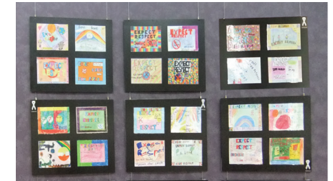
3 Part of a 120 poster display, Mount Barker Library, 2018