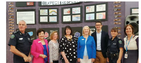
Guests at the Community Event, Mount Barker Library, 2017