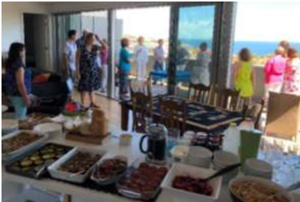
Scrumptious brunch ready but firstly a few words about Amelia's Earhart's feats