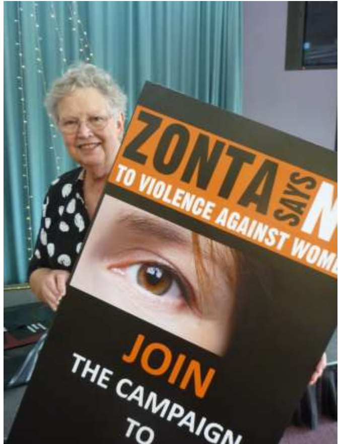
Our pin up Girl 2016