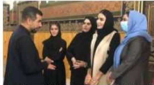
Herat Governor Wahid Qattali praised the activists who led the campaign to reclaim the identities of Afghan women