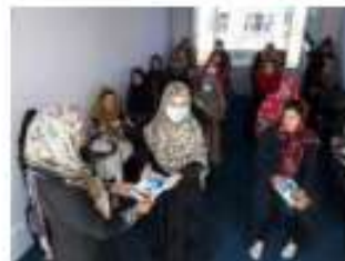
From SAWA-Australian (SA) newsletter