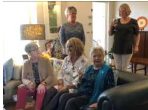
A toast to our retiring members