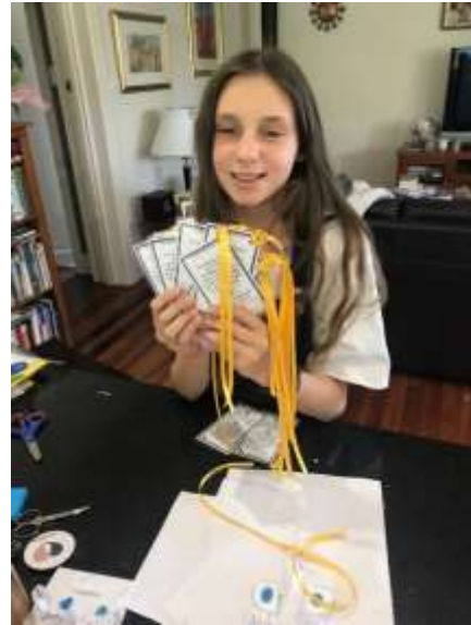
Adelaide helping to prepare cards to go with flowers in remembrance of the Anzacs.