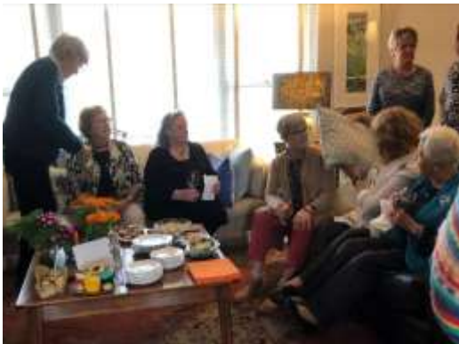
Enjoying afternoon tea