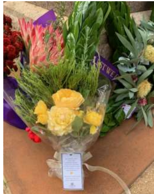
Flowers at the Mylor War Memorial