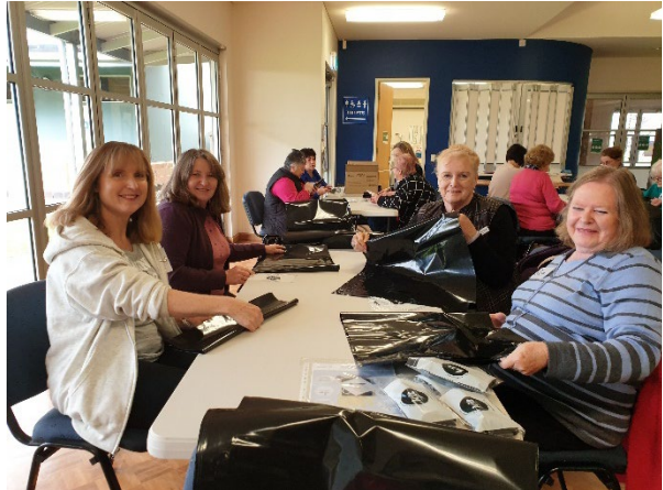
Folding the plastic ground sheet