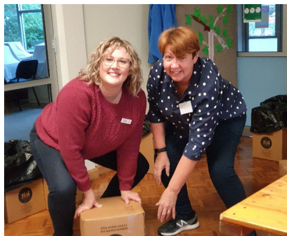
Packaged up ready to GO