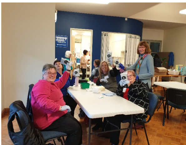
1400 packs made