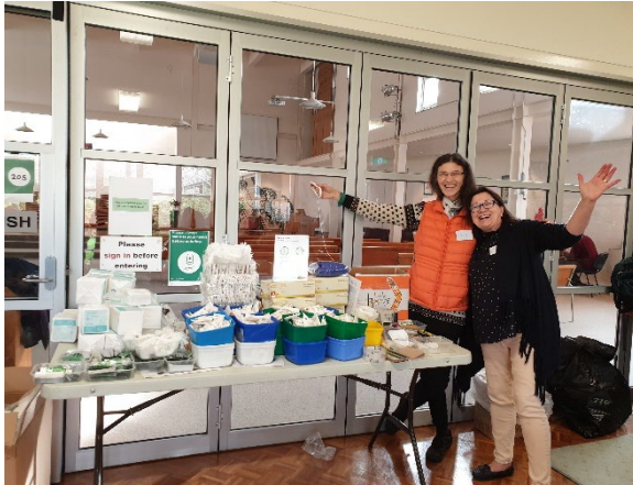
The day begins