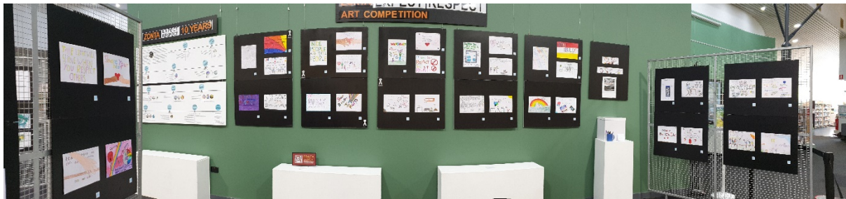
The display of 41 pieces of Art related to Respect in Relationships by the Year 5 Students of St Francis De Sales Collage.