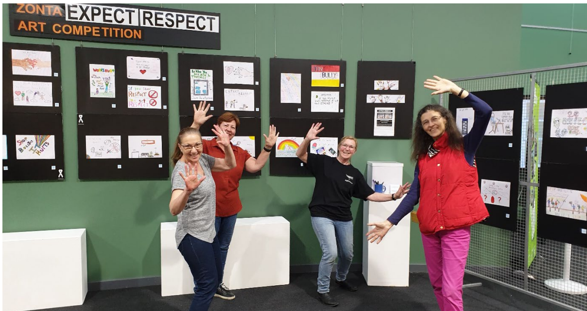
Hands has become the symbol for all of the elements of the Zonta Expect Respect Project on the website and tend to feature in student work. The installation team celebrate here with Jazz Hands.