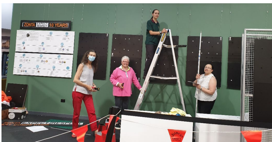
Thursday evening at the Mount Barker Community Library.