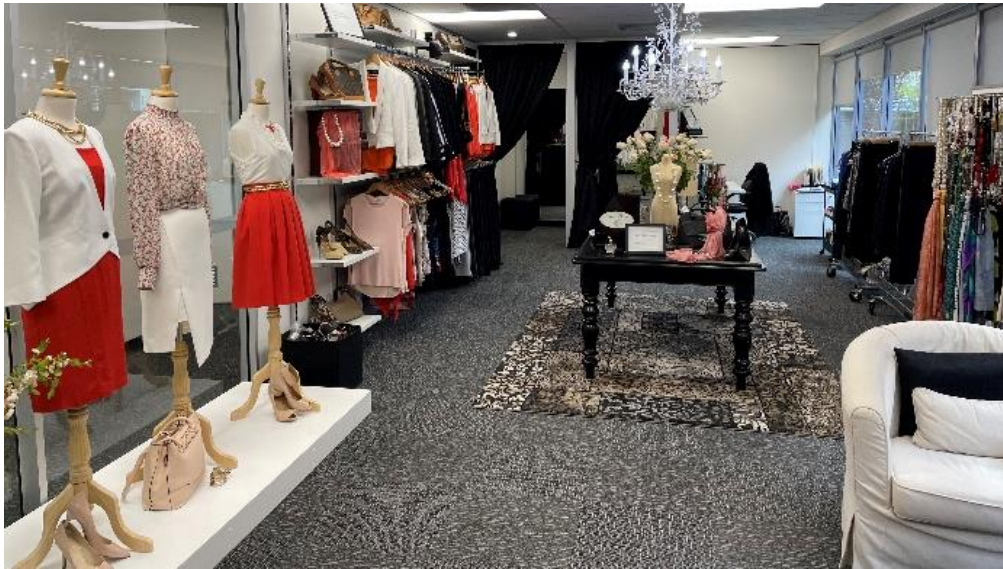
Above: The Change room at Dress for Success