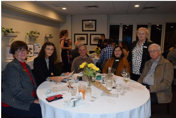
Members and guests enjoying the evening