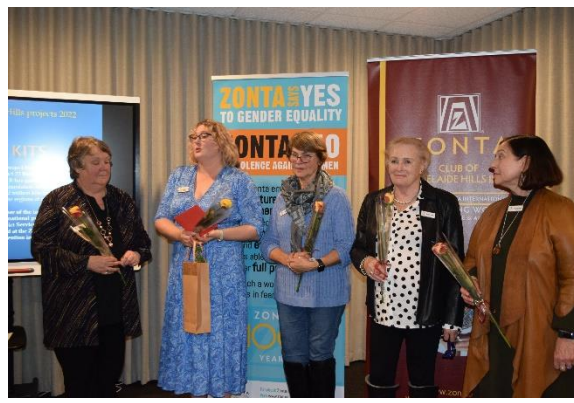
The incoming Board members

"Nothing in life is to be feared, it is only to be understood."