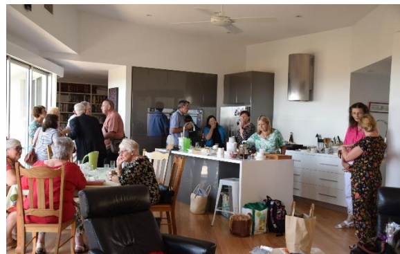
Members & guests enjoying the day