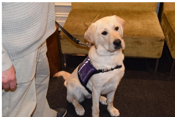
Not quite our guest speaker but star of the show!