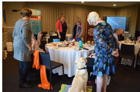
We chose to wear orange to acknowledge Zonta says No to Violence against Women