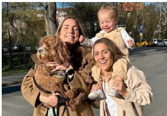
Katrina Gorry with her family