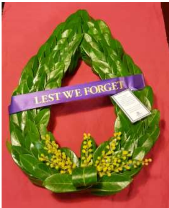
Above: Our Wreath