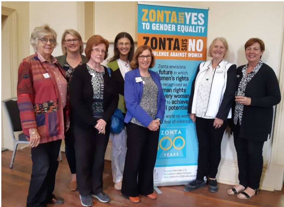
The ZCAH group at the Area 2 Workshop in Mintaro, April 13.

The Area 2 workshop was held at the Mintaro Institute, Mintaro on Saturday April 13 th and hosted by the Zonta Club of Clare and Districts. The theme was 'Yesterday, Today and Tomorrow – Change makers'.