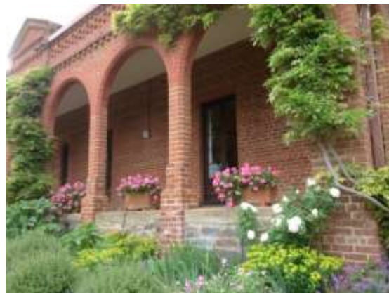
Beaumont House, the destination of the Pioneer Women's Trail and of our fitness and fundraising drive.

Look out for the ad's in this ZAH News for upcoming walks.