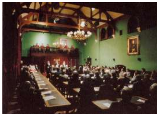
The House of Assembly Chamber in Old Parliament House, North Terrace, Adelaide