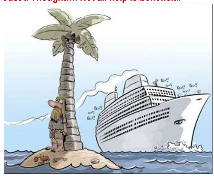
Just a Thought.... Not all help is beneficial